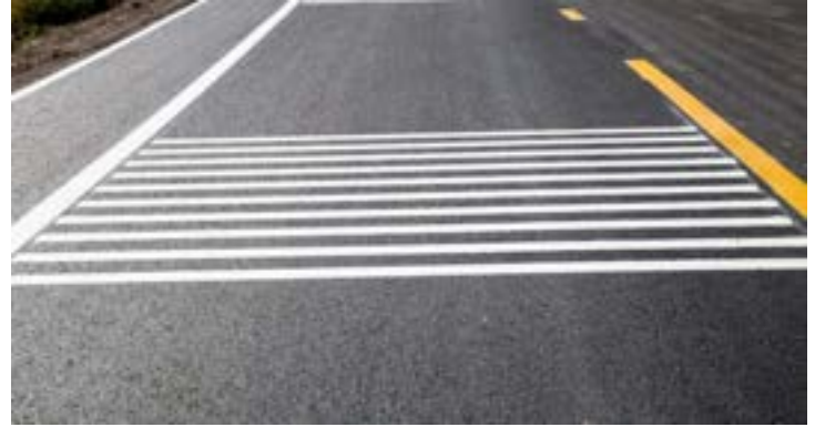
Transverse Rumble Strips