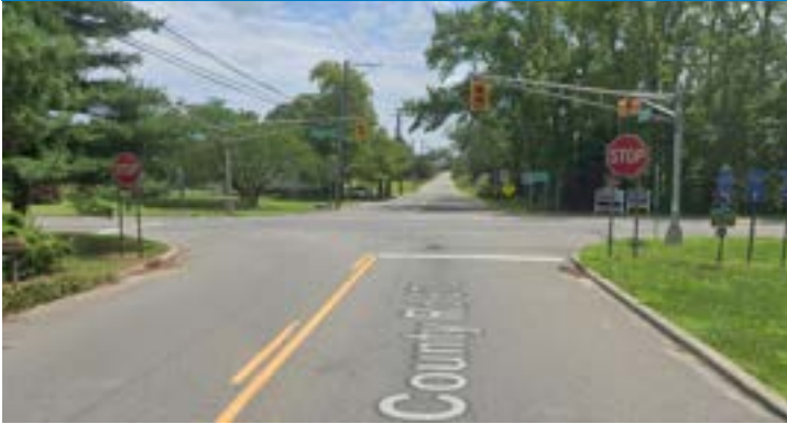
Overhead Flashing Beacons / Dual Stop Signs