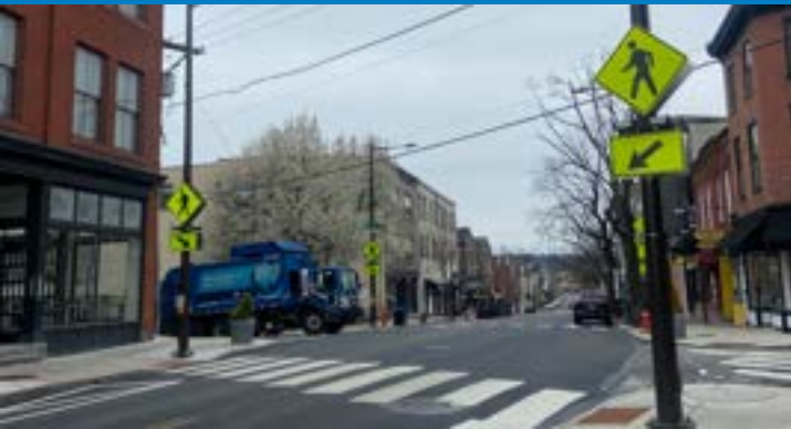
Rapid Rectangular Flashing Beacon (RRFB)