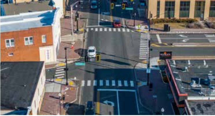
Curb Extensions / High Visibility Crosswalks