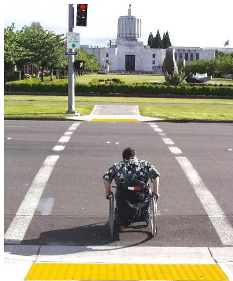
An LPI allows a pedestrian to establish a presence in the crosswalk before vehicles are given a green indication.

FHWA's Handbook for Designing Roadways for the Aging Population recommends the use of the LPI at intersections with high turning vehicle volumes. Transportation agencies should refer to the Manual on Uniform Traffic Control Devices for guidance on LPI timing and ensure that pedestrian signals are accessible for all users. 1 Costs for implementing LPIs are very low when only signal timing alteration is required.