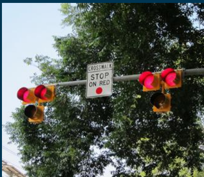
Example of PHBs mounted on a mast arm.

reduction in fatal and serious injury crashes. 4