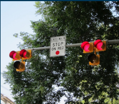
Example of PHBs mounted on a mast arm.

reduction in fatal and serious injury crashes. 3