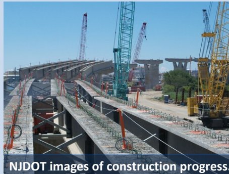
NJDOT images of construction progress.

The New Jersey Department of Transportation (NJDOT) began in Summer 2006 the first part of its $400 million project to replace the Route 52 Causeway bridges and the roadway section between Somers Point and Ocean City, including the elimination of the Somers Point Circle. The work is expected to last until 2012. This is one of NJDOT's largest projects and is critical because it is the emergency evacuation route for Ocean City.