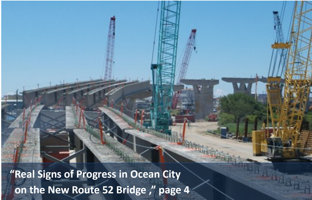
“Real Signs of Progress in Ocean City on the New Route 52 Bridge ,” page 4

782 South Brewster Road, Unit B6, Vineland, New Jersey, 08361 | Tel: (856) 794-1941 | Fax: (856) 794-2549 | www.sjtpo.org